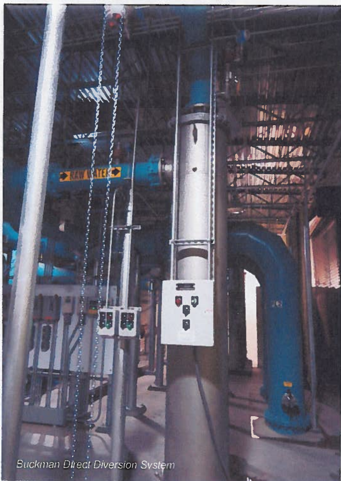
Buckman Direct Diversion System

Santa Fe County has a practice of putting forward bond questions every four years during the general election, and then issuing any approved bonds two and four years after voter approval. The debt service for those bond issuances is then structured in such a manner as to maintain fairly static general obligation debt service payments. This methodology serves the dual purpose of continuously maintaining funding for needed capital projects in the County, while ensuring that the property tax rates for debt service remain stable. Santa Fe County's debt service property tax rate was 1.640 mills for tax year 2012 (11/1/12 – 10/31/13)