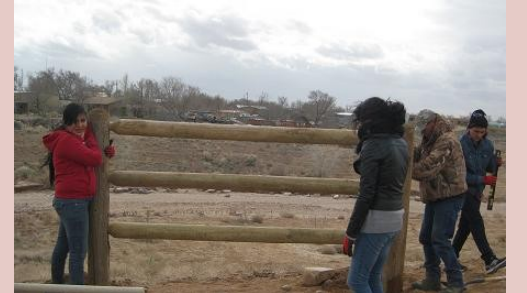
Images of Students working on various projects.