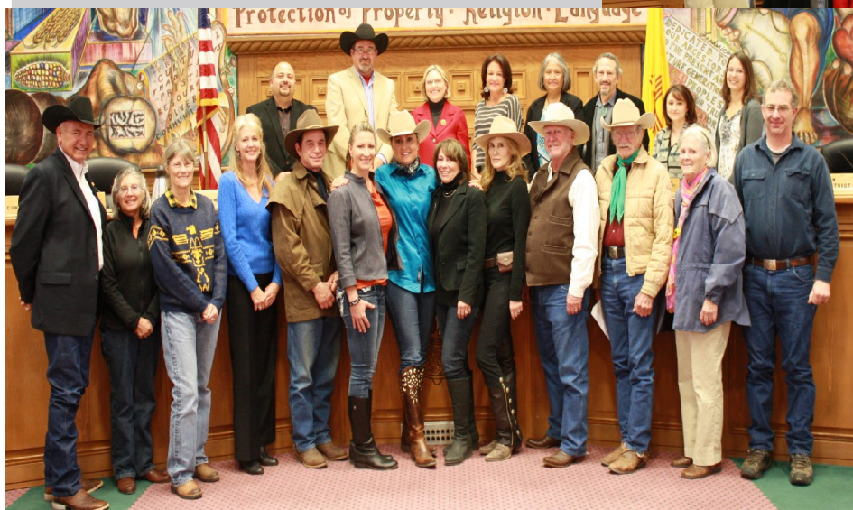
Left —Support of the Equine Culture and the promotion of Santa Fe as a Regional and International Horse Destination.