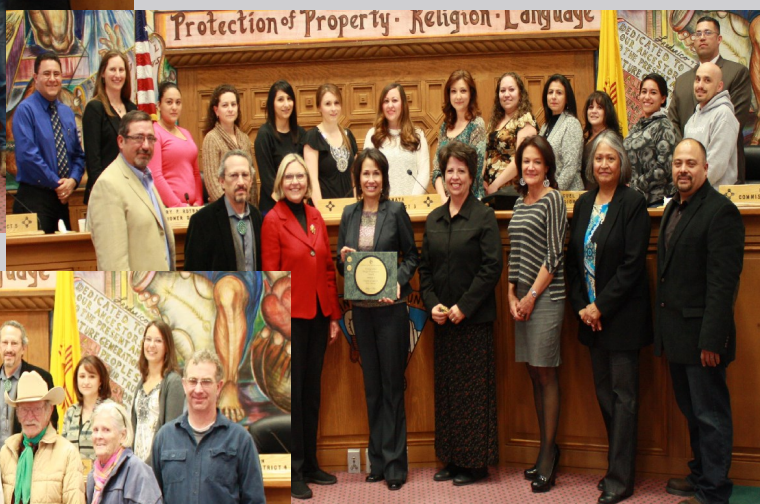
Below — Santa Fe County Finance Division received the Government Financial Officers Association Distinguished Budget Presentation Award to the County of Santa Fe for Fiscal Year Beginning July 1, 2013.