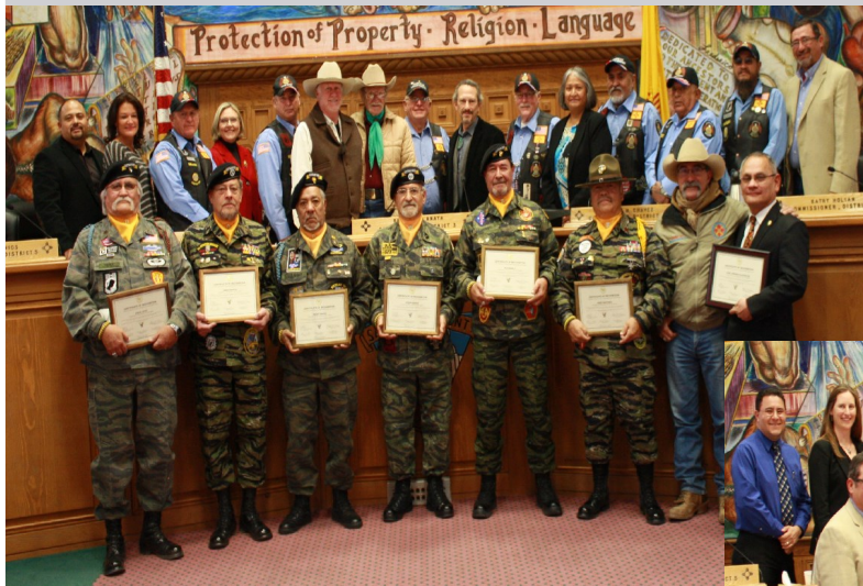
Left —Honoring Our Veterans and Service Men and Women.