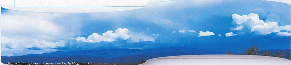
Storm building over the Sangre de Cristo Mountains