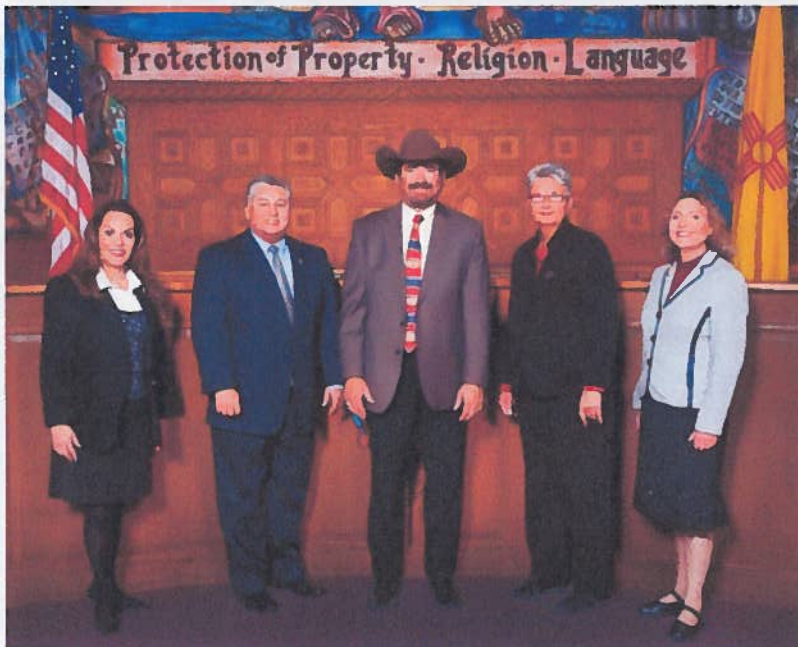
Santa Fe County Board of County Commissioners