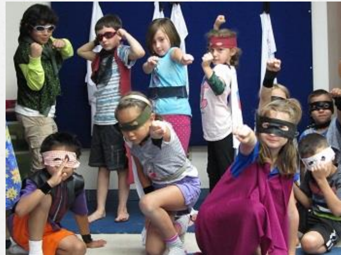
(Santa Fe School for the Arts & Sciences: Reading is Magic)