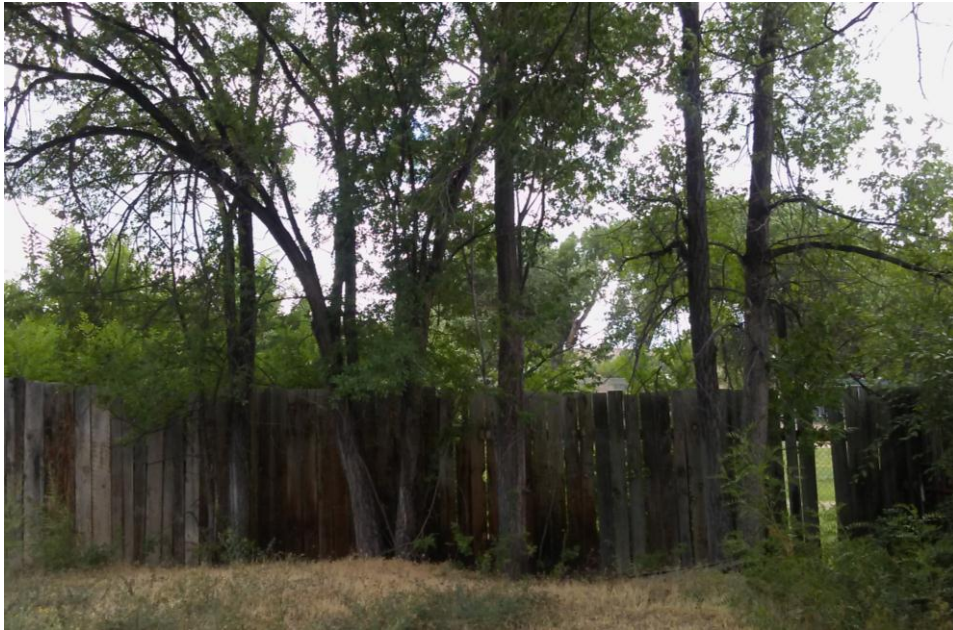
(remove all trees pictured above: 4 stumps, 6 stems)