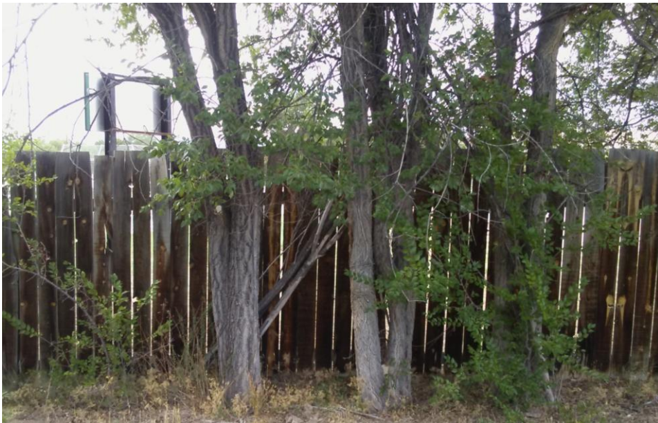
(remove left tree only pictured above – 1 stump, 2 stems)