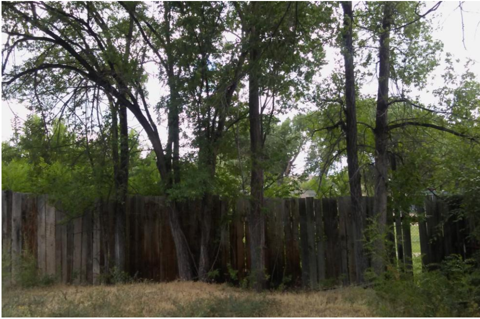
(remove all trees pictured above: 4 stumps, 6 stems)