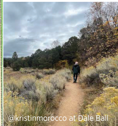
@kristinmorocco at Dale Ball