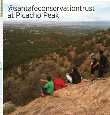
@santafeconservationtrust at Picacho Peak