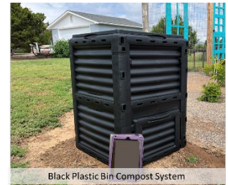
Black Plastic Bin Compost System