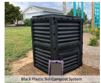
Black Plastic Bin Compost System