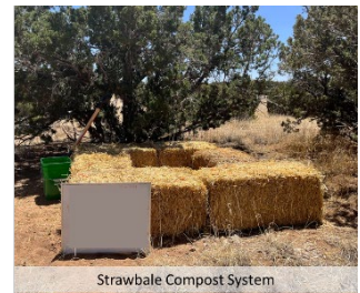
Strawbale Compost System

Submit the completed application and agreement via e-mail, mail, or in-person by 5:00 PM on May 31, 2024 . Eligible applications will be reviewed and accepted on a first come, first served basis. Any applications received after the deadline will be added to a waiting list for future installations. You will receive notice indicating if you have been selected for the program by June 7, 2023.