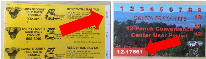
Where to locate your bag tag or permit number

14. Which County Commission District do you reside in?