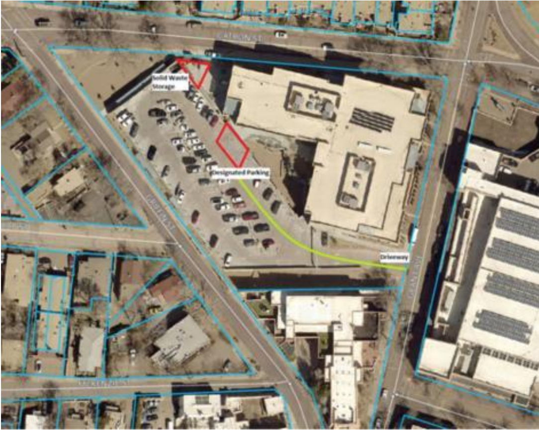
An annotated site plan for the 100 Catron St., Santa Fe County Administrative Complex. Site plans must have designated structures, parking spots, solid waste (trash) storage, and driveway clearly distinguished.

Example Site Plan with the Required Annotations: