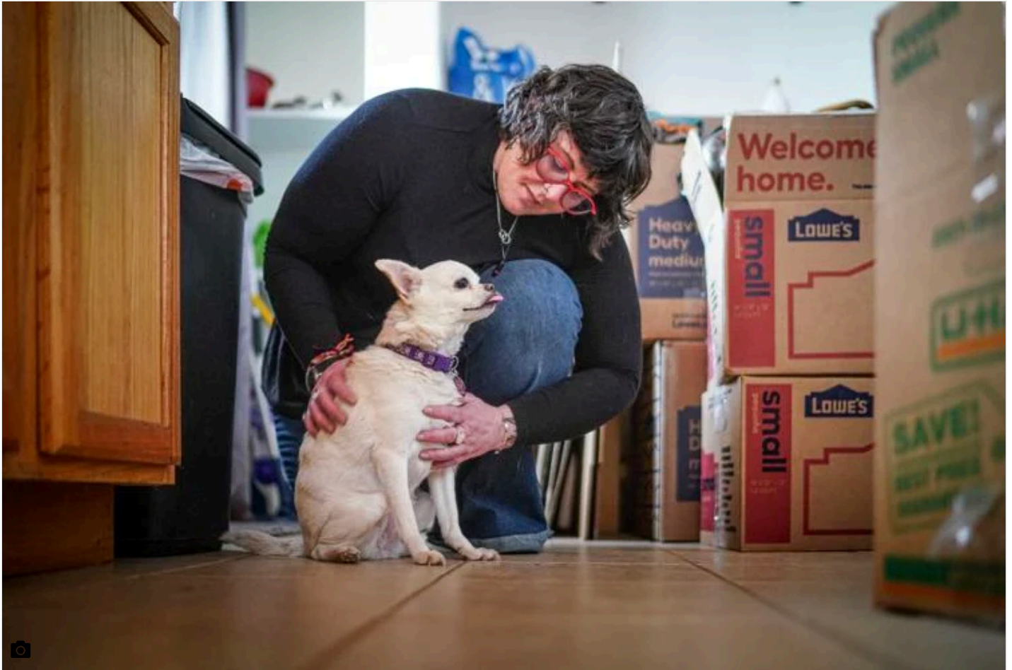
After mental health crisis ends, a patient's wait begins

“With the growing number of addicts in the state and in the country and in the world, the need for rehabilitation, as opposed to, like, throwing people in jail, needs to be more prevalent,” he said. “ ... To accommodate the need and all the people requiring services is going to take a tremendous of funding, not just statewide but federally.”